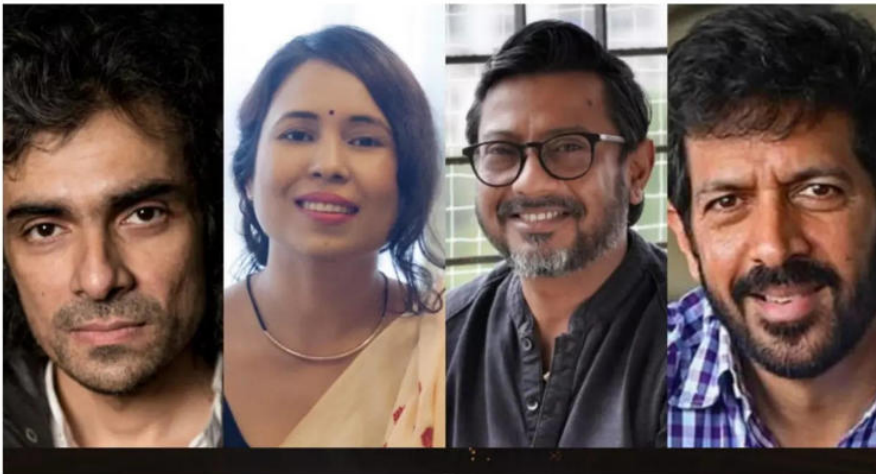
The stories we've told are not just about the diaspora but displacement: Imtiaz Ali