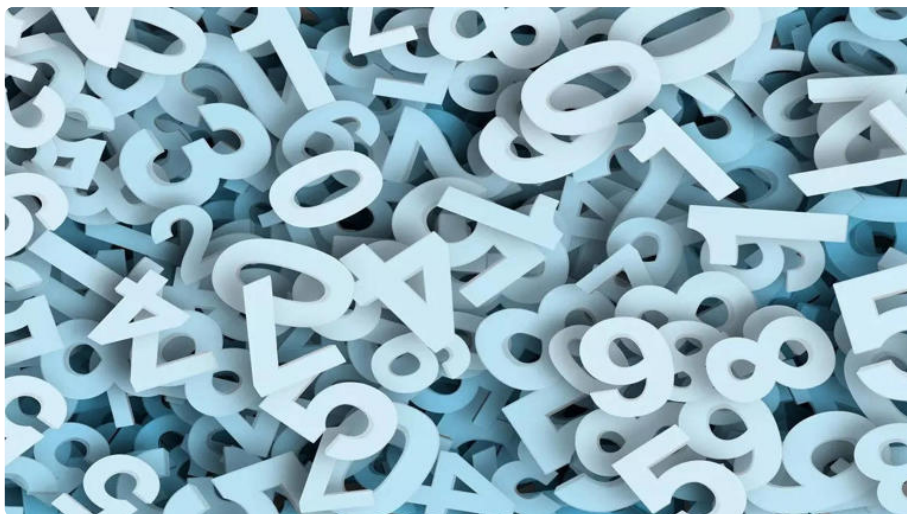
The Calm Ones: Understanding People Born on 1, 10, 19, 17, 28, 15, 8, and 26

People born on these specific dates often embody a unique blend of calm strength and hidden intensity. Whether it's the first day of the month or dates like the 10th, 19th, 17th, 28th, 15th, 8th, or 26th, those with these birthdays are generally known for their tranquil demeanor, grounded energy, and unshakeable focus. They move through life with a quiet confidence, radiating a sense of stability that others naturally gravitate toward.